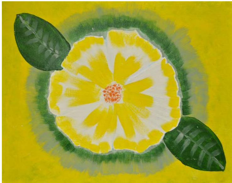
By: Amy H. Lapeer County

After you receive emergency behavioral health care and your condition is under control, you may receive behavioral health services to make sure your condition continues to stabilize and improve. Examples of post-stabilization services are crisis residential, case management, outpatient therapy, and/or medication reviews. Prior to the end of your emergency-level care, your local community mental health (CMH) will help you to coordinate your post-stabilization services.