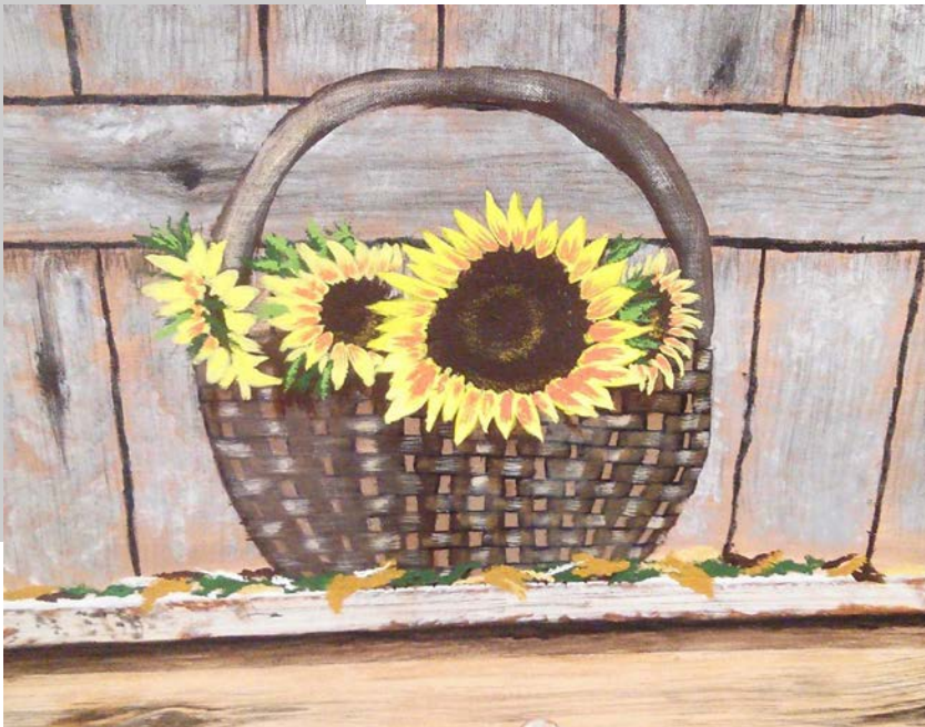
Sanilac County

Providing public services for mental health and substance use disorders through the Community Mental Health agencies in Genesee, Lapeer, Sanilac and St. Clair Counties and a panel of other care providers.