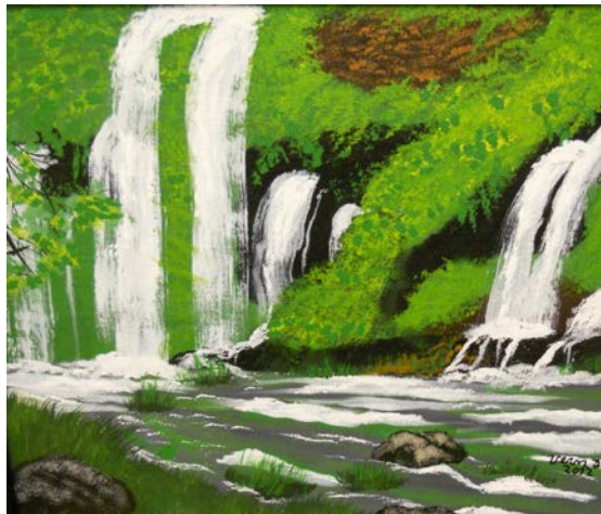
By: Vern F. Sanilac County

If you are being treated in a hospital, halfway house, or other live-in setting as part of your treatment for substance use disorder, you have some additional rights, such as the right to keep your own money and the right to know the rules about having visitors. These rights are included in the “Know Your Rights” brochure in your Welcome Packet.