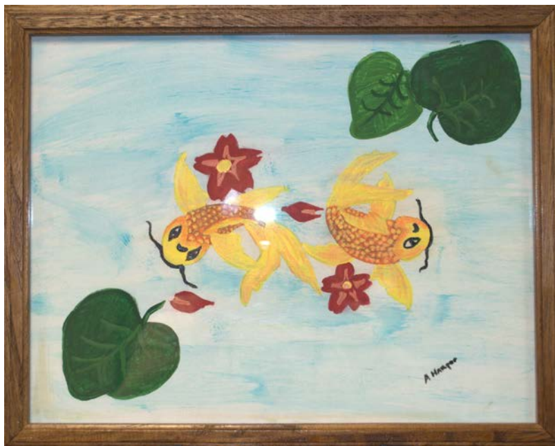
By: Amy H. Lapeer County

NOTE: If your benefits are continued because you used this process, you may be required to repay the cost of any service(s) that you received while your appeal was pending if the final resolution upholds the denial of your request for coverage or payment of a service. State policy will determine if you will be required to repay the cost of any continued benefits.